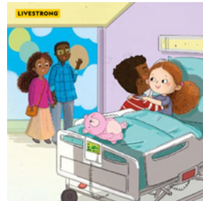
Children's Book Support