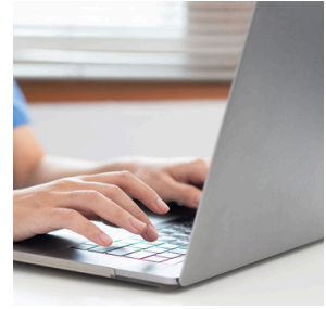
Ellis: The First AI Survivorship Companion